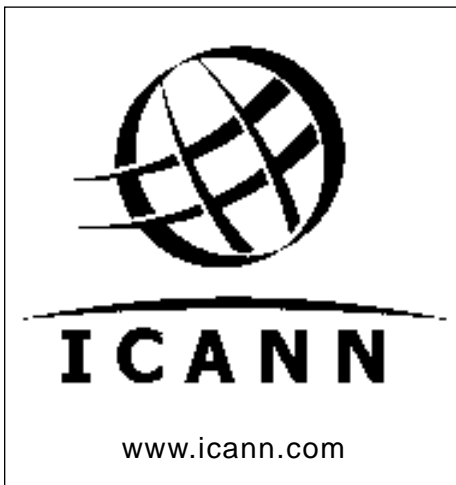
Logo of the Internet Corporation for Assigned Names and Numbers. Formed by the private sector to assume responsibility for the management of the domain name system.

With respect to domain names using ".com" and ".net" (Top Level Domains), the selection of quality names is increasingly limited.